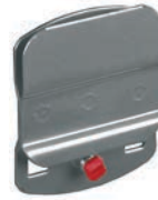
Grab container - holder