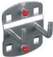
Double, with inclined hook-end, L=50