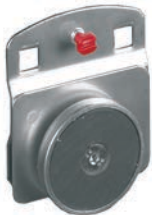
Magnetic holder, D=40