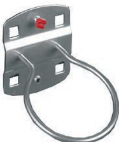
Machine holder, D=60