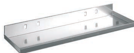
Shelf board, B=350, T= 125