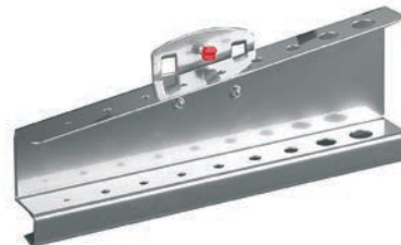
Hexagon socket wrench holder, D=1-11